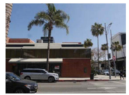
9647 BRIGHTON WAY N.T.S.