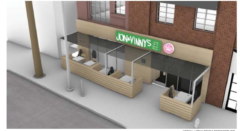
AERIAL VIEW FROM BEDFORD DR. LOOKING NORTHEAST