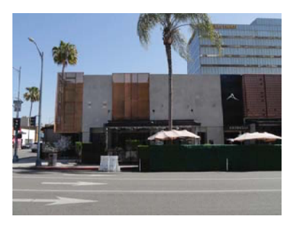
468 N BEDFORD DR N.T.S.